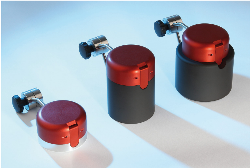
Left to right: PMT 05p, 70icu, 120icu

The PocketMonitor (PMT) is a mobile power measuring device which can be employed easily and was designed for the application in everyday production. The compact and robust design as well as the fast and simple application are key features.