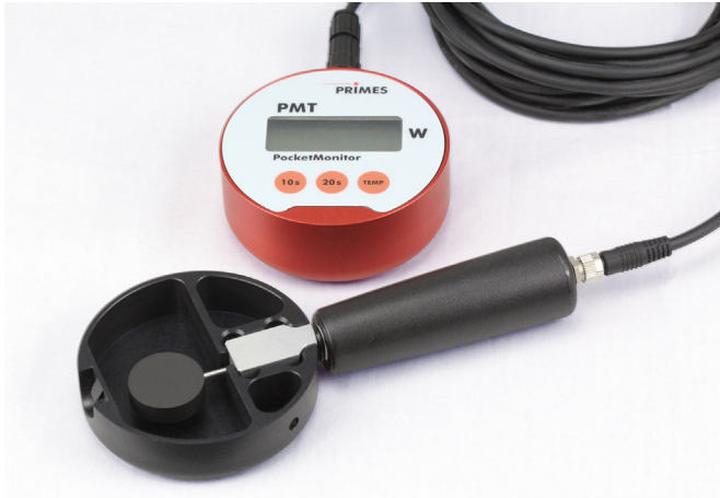
PMT 01p with separate absorber