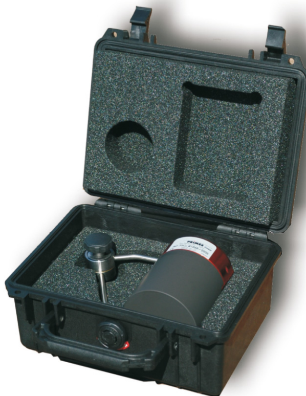
Transport box for the PMT

As all options are available for the entire absorber range, the PocketMonitor is a very flexible measuring device.