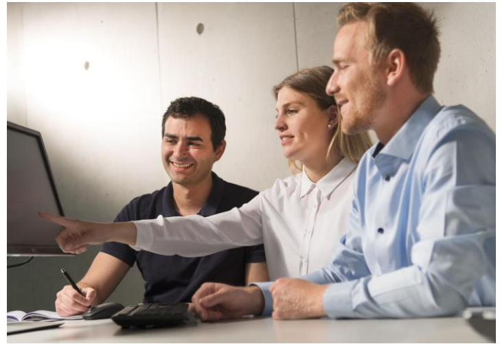
CAD-modeling in our seminar with SolidWorks™.