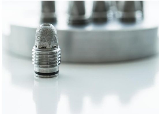
Figure 1: 3D printed nozzle for a sewer cleaning system, optimized by TRUMPF.

The nozzles' design is simple, but it still takes four steps to manufacture these attachments. The first is to cut the raw material and then thread it on a lathe to create what is in effect a massive bolt. Then two blanks are placed in a milling machine to cut the contours of a nut into the front face. Finally, a worker glues in a ceramic insert by hand. "The operator has to remove the component from the machine for each step. What's more, gluing often leaves imperfections that change the jet's guidance," says Fatih Arikcan, additive manufacturing application engineer at TRUMPF, with a note of disapproval.