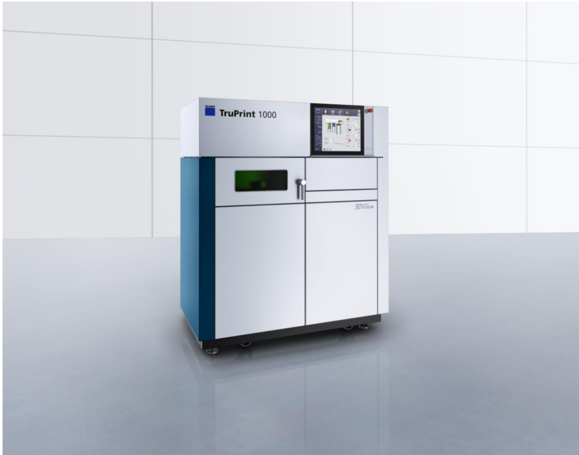
Figure 1: The TruPrint 1000 from TRUMPF is a compact machine for the production of small metal components by laser metal fusion.