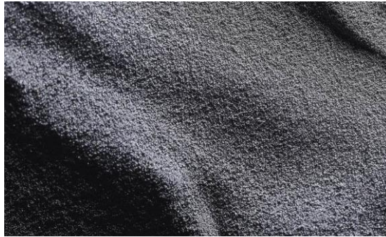
Figure 1: TRUMPF metal powder.