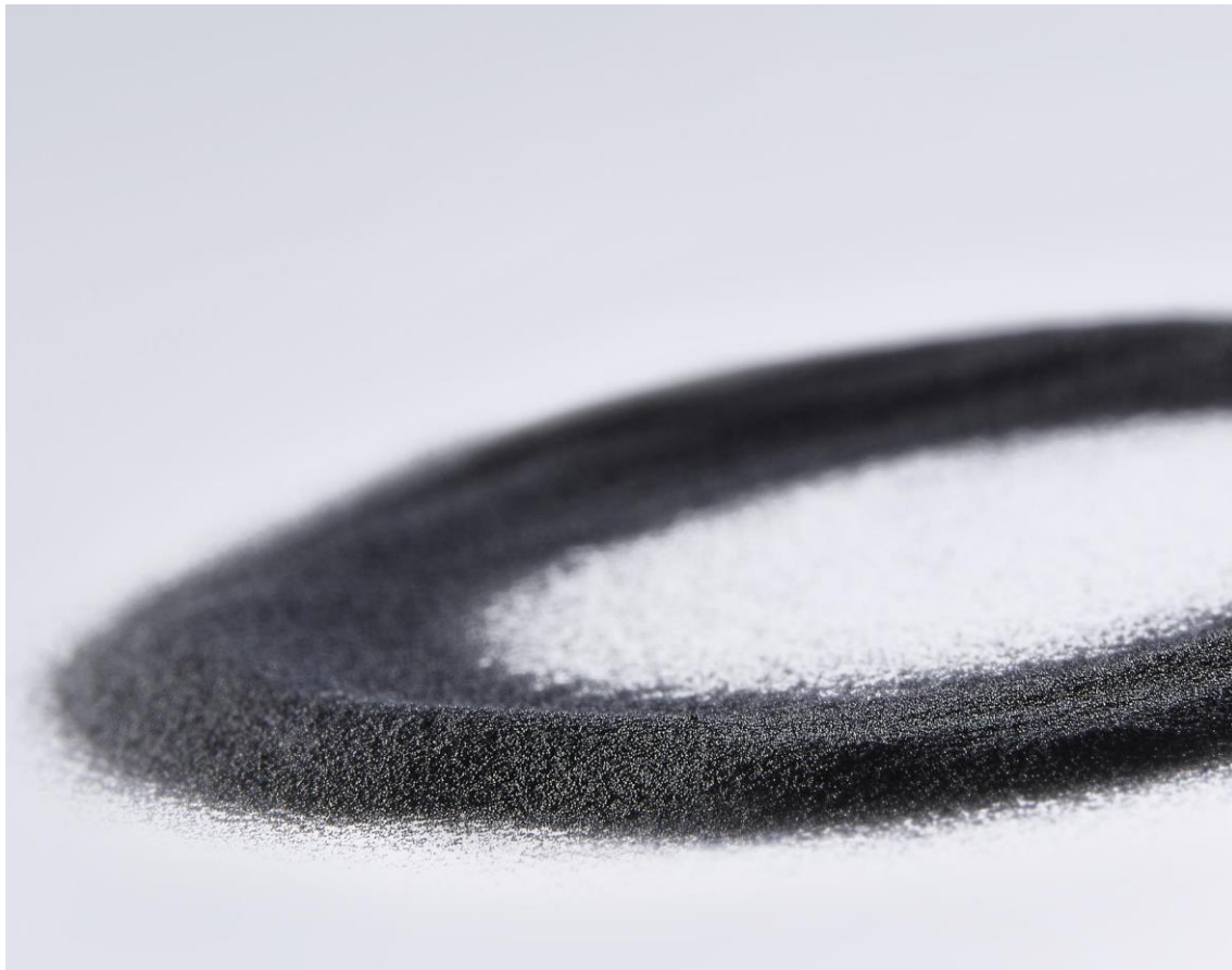
Figure 2: The best powder for your TruPrint.